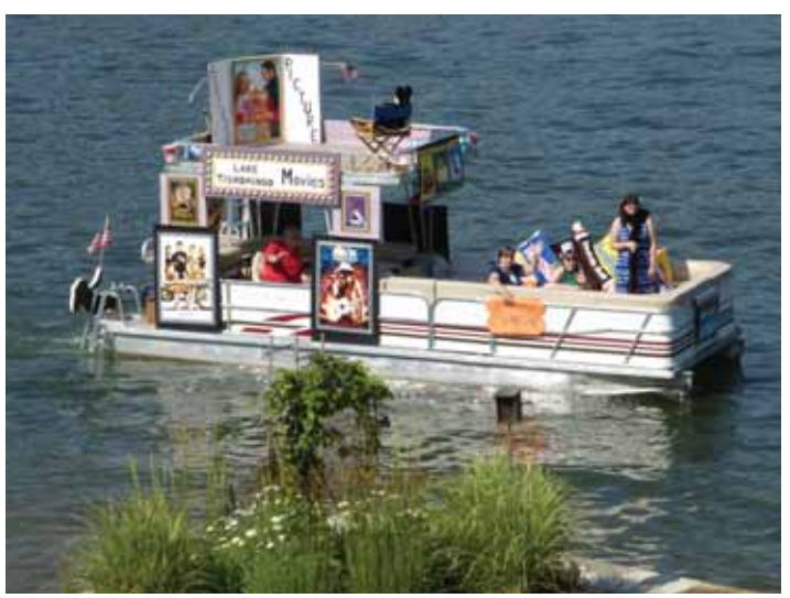
Lake Tishomingo Movies, Schaab, second place.