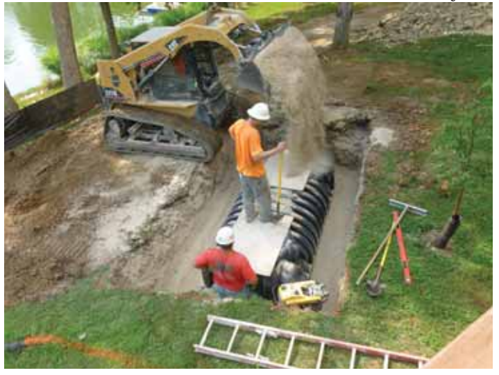
Installation of a residential STEP tank requires a minimum of six inches of compacted gravel on all sides.

The contractor for the sewer project, TGB Contracting, reports