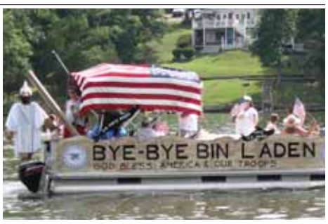
Second place winner of the Fourth of July boat parade.