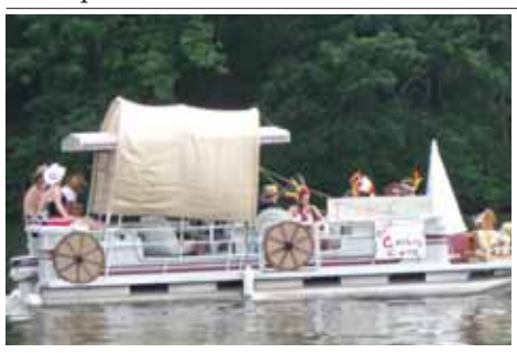
First place winner of the Fourth of July boat parade, Rodgers G29.

The November dinner meeting will be Nov 13<sup>th</sup> at 5:30 LTIA providing Turkey, mashed potatoes and gravy. Please bring a side dish or dessert. We need LITA Board Members. The more board members we have the more great ideas we have as well as the needed help in making the community a fun place to live.