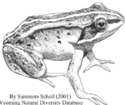
By Summers Scholl (2001) Wyoming Natural Diversity Database

If all goes according to plan, construction begins next year