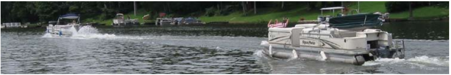
Barb Rohm easily wins every heat.