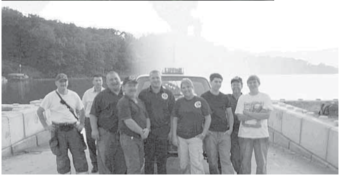
Goldman Fire District firefighters say "Thanks for your support" to Lake Tishomingo. In the recent election voters approved a tax increase to hire additional full-time professional firefighters. These photos are of a training session August23 at the lakefront.

PRSRT STD US POSTAGE PAID HILLSBORO MO PERMIT NO. 9