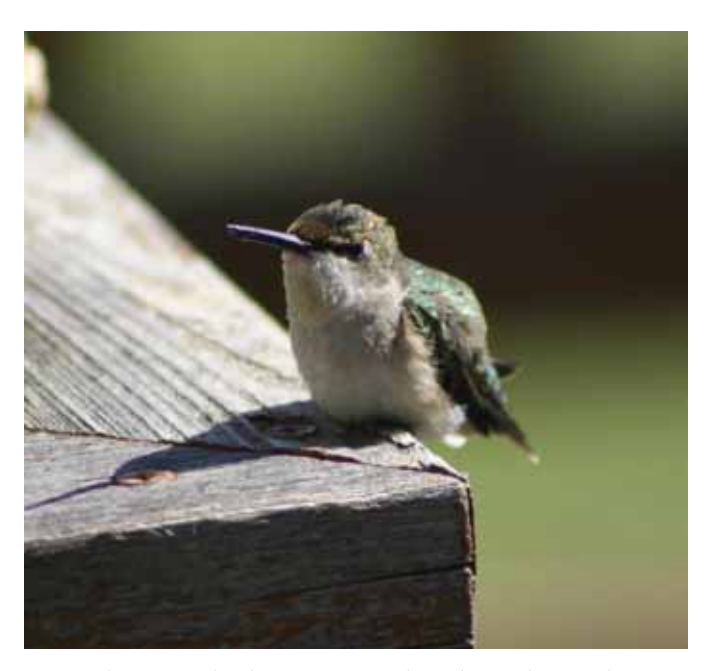
Young humming bird, August 17.