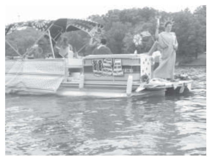
Second Place -- Blaha, A-16, "Lady Liberty." Not shown: tied for Third Place -- Farwig, "Takin' a Bath" and Dierzbicki "Sports."