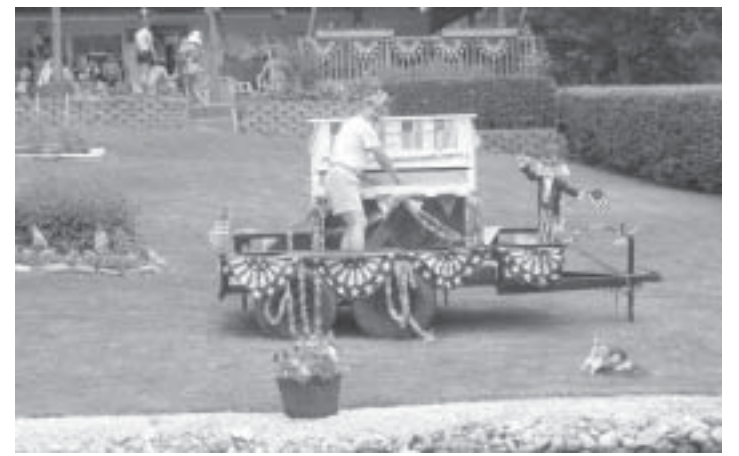
A patriotic song for the boat parade.