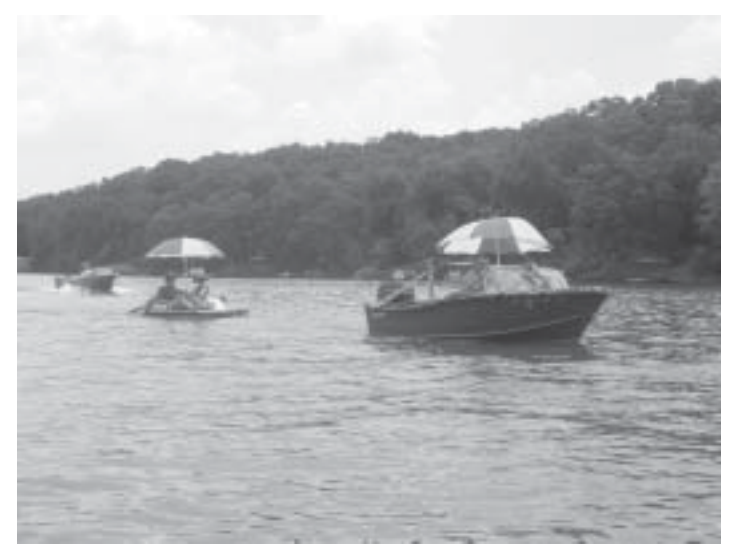
Second Place -- Blaha, A-16, "Patriotic"

Thank you to everyone who participated in the boat parade.