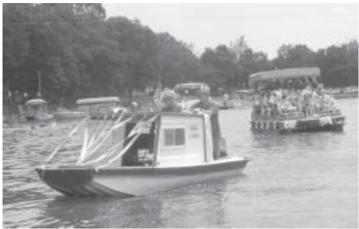
The parade began at 1pm. The lead boat was the Lake Patrol piloted by Ed Melchior.