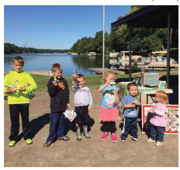
First and second place winners of the fishing tournament.