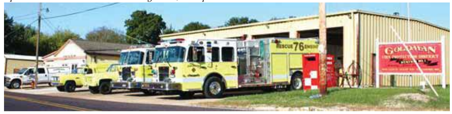
A Message from the Fire Chief

reprinted from the Nov/Dec 2008 Tishomingo News, with updates