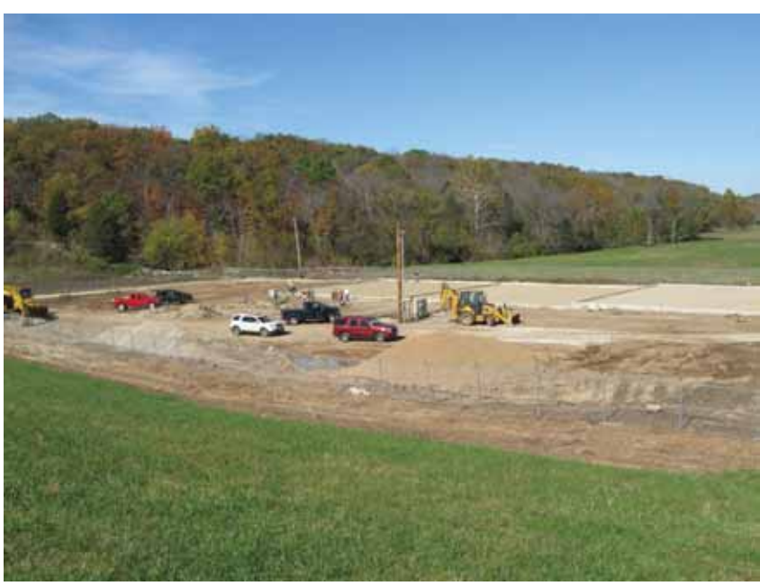
View of the treatment plant from the top of the dam.

If you requested any changes from the designed sewer plan, you may not be entitled to complete restoration. For example, replacement of any concrete that was removed as a result of the homeowner's request is the homeowner's responsibility.