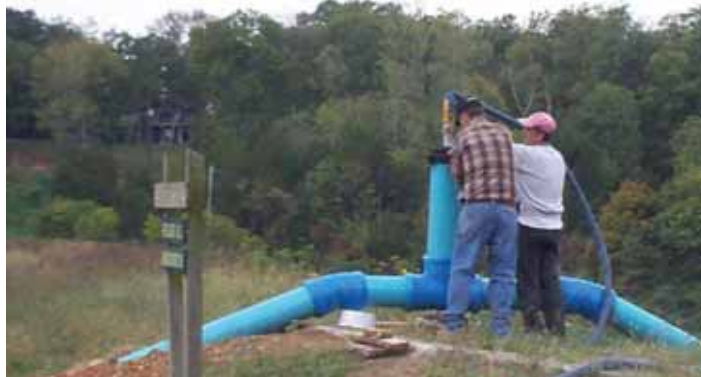
Ron Sansone and Rich Hirsch attach the hose from the pump to the valve at the top of the siphon pipe. Not shown: Rick Hannick and Ken Jost.

Average annual precipitation in this area is about 40 inches and our watershed is 15 times the area of the lake. So the lake level should rise again before the next summer season begins.