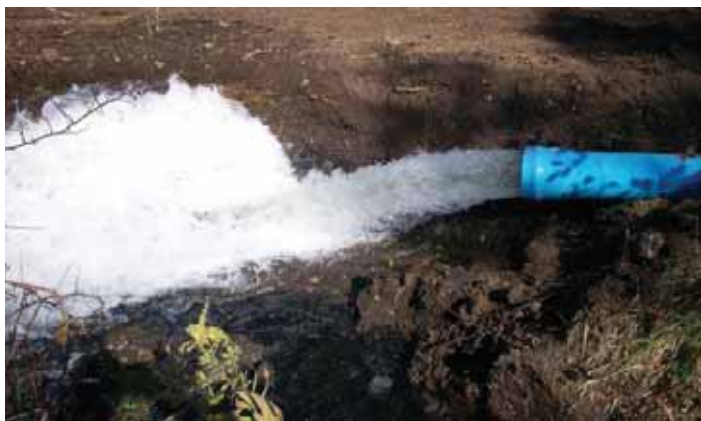
Siphon outlet flow is approximately 3500 gallons per minute.