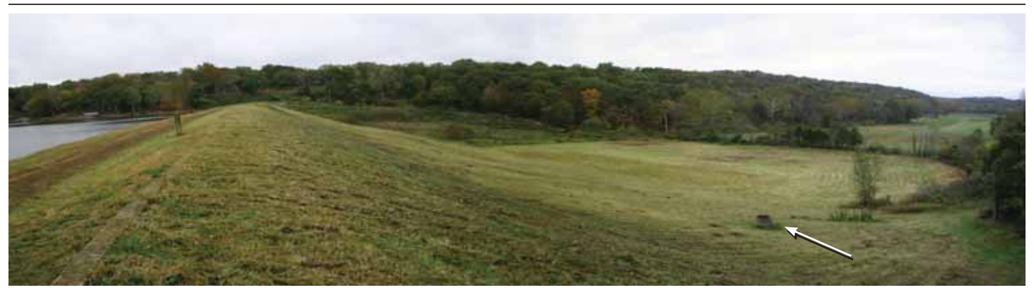
Back of the dam from the north side, Oct 11, 2006. The grass and weeds have been cut. The seepage collector is visible on the right (arrow).