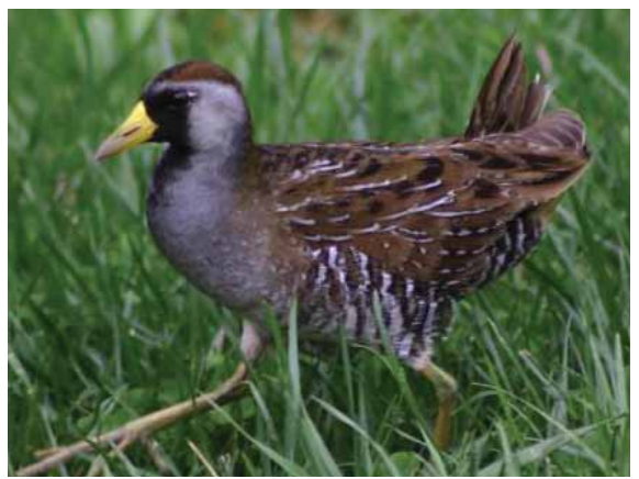
Sora at Lake Tish.