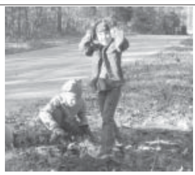
Remember back in the Fall when the kids were planting bulbs . . .