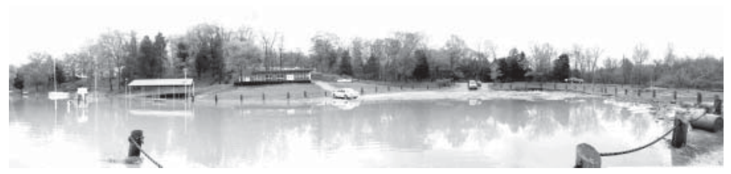
The parking lot was completely flooded Thursday morning. When the water receded the parking lot had huge ruts and gullies. Wide angle photo by R Hirsch.

On the north side of the berm the dirt base around the utility pole was washed away and UE had to be called in to stabilize the pole until rock could be piled around the base in place of the dirt. There was substanial damage to the parking lot where much of the gravel was removed, leaving large ruts.