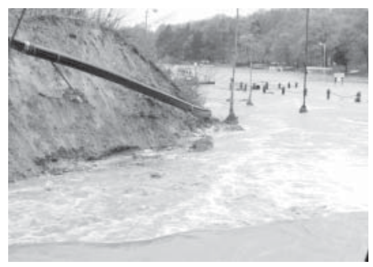
The north side of the berm during the flood, viewed from the road.