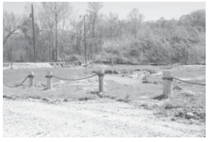
The north side of the berm and the volley ball area after the water receded.