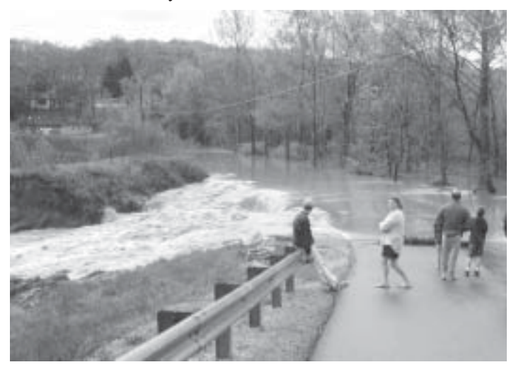
The south side of the berm during the flood, viewed from the bridge.

There was also substantial damage to the low-water bridge on the south side where much of the soil was undercut and removed by the fast moving water. This is in addition to damage suffered by individuals who had retaining walls destroyed and boats swamped and lost.