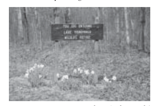
. . . here is the result!