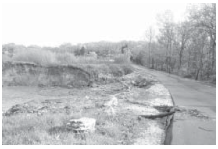
The south side of the berm after the water receded.