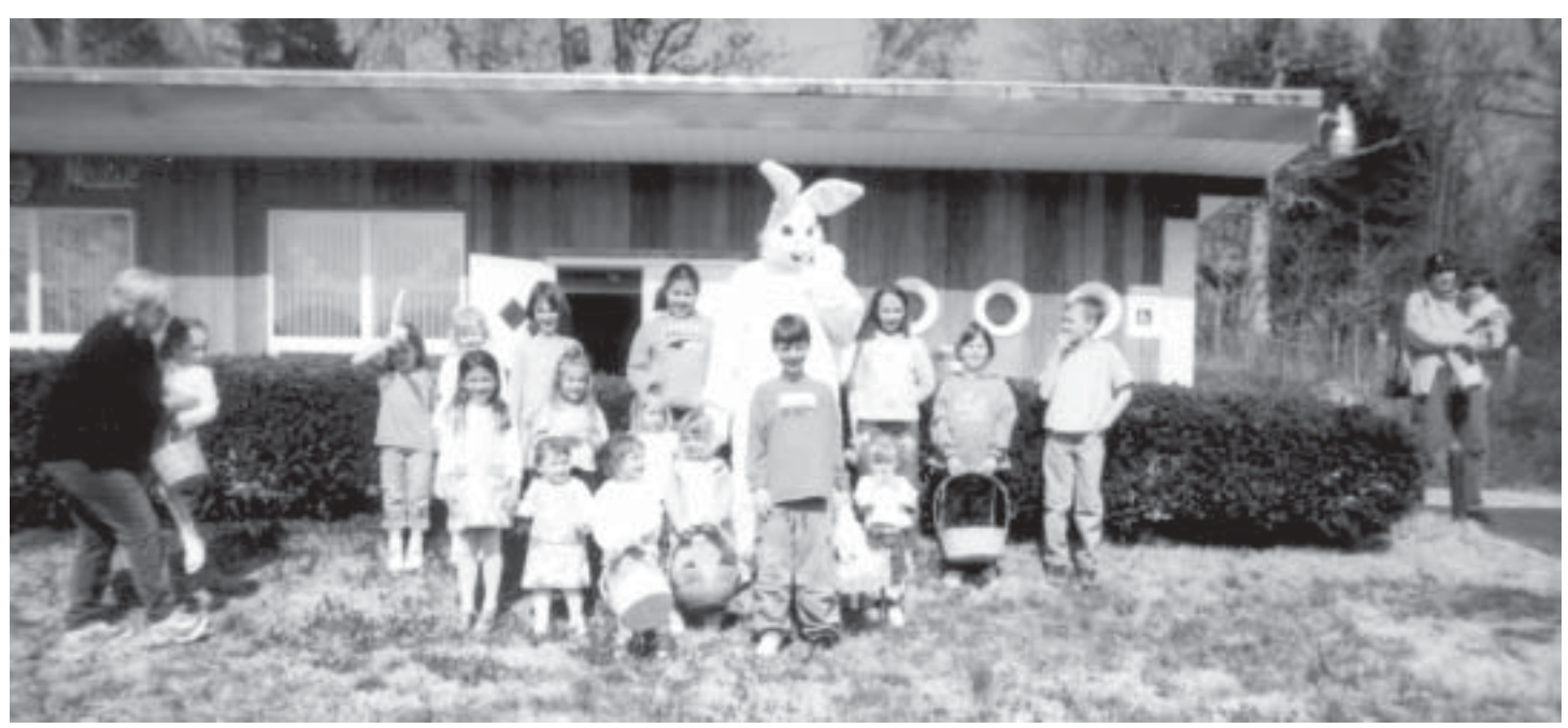
Kids' Easter Party -- 18 children participated and met the Easter Bunny in person!