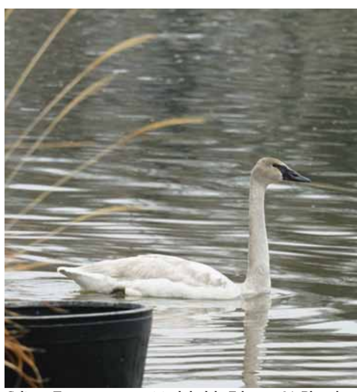
Solitary Trumpeter swan visited the lake February 24.

If you observe anyone operating an ATV on private lots or off-road lake property you can report the trespassing to the Jefferson County Sheriff: (636) 797-5000.