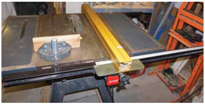
• For Sale: Sears Craftsman 10-inch Table Saw with legs, two table extensions, $150 or OBO.

Carpeted and very clean, two fishing seats, live well, newer batteries (X2), sump pump, new ('15) Lawrence fish finder, new ('15) Minn Kota Edge trolling motor with foot pedal, trailer and all titles. $2,950.