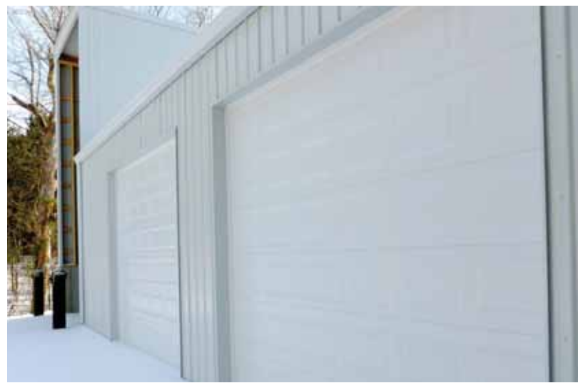
New maintenance building with two garage doors and large open bin for salt storage.

Lake Resident Since 1973 #1 Real Estate Office in NW Jefferson County Specialties include Lake Properties