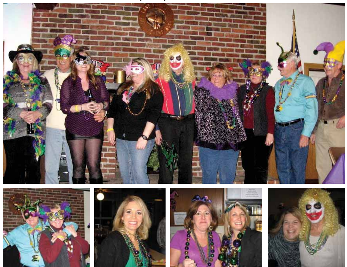
View more Mardi Gras Dance pictures at www.laketishomingo.com/gallery.