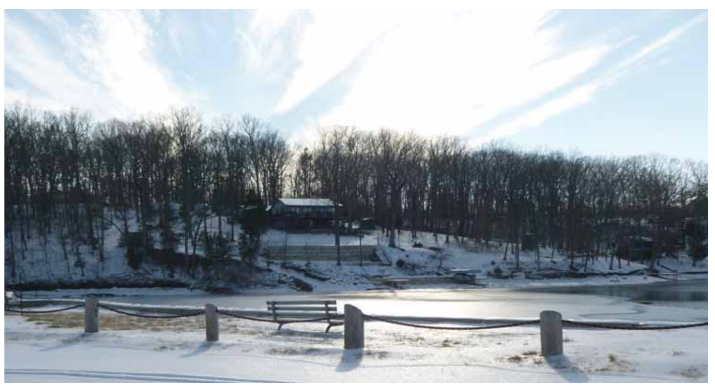
Snow and ice accumulated Thursday February 21 and turned the lake into a sparkling winter scene.