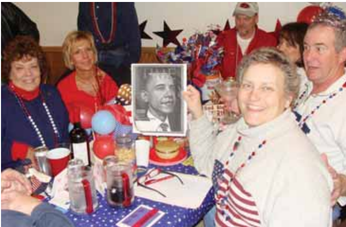
Team McGlynn-Schreirich decorated their table with theme "Election."