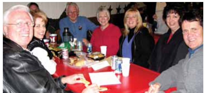
Left and above: Team Lents.