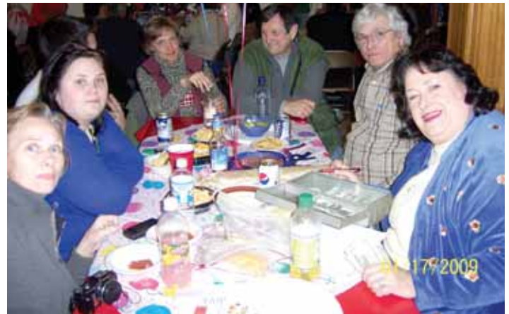
Team Leiweke decorated with a party theme.