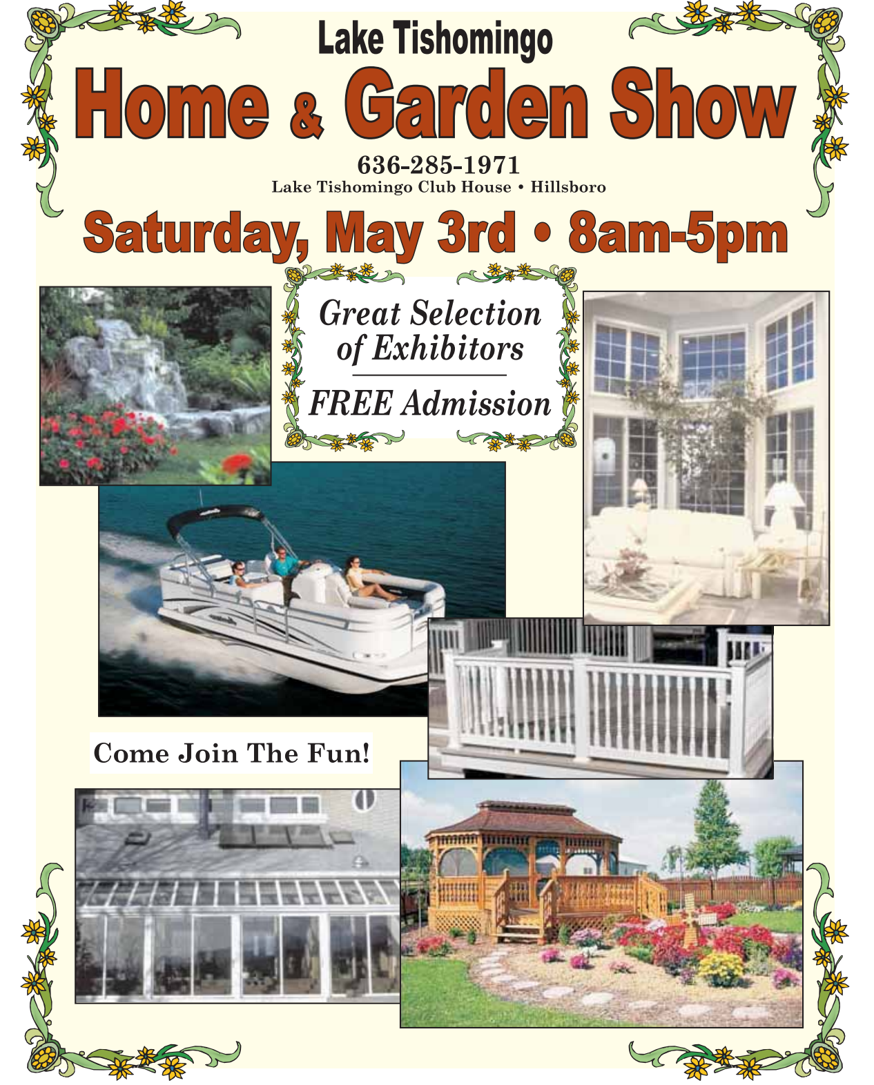
Plan to attend the 1st Annual Lake Tishomingo Home, Garden & Boat Show Saturday May 3rd

Volunteers are needed for this community project: