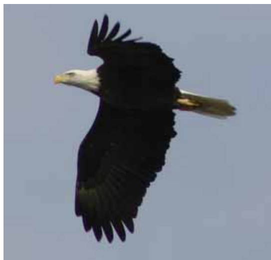
Great bald eagle at Lake Tish Feb 9, 2007.

PRSRT STD US POSTAGE PAID HILLSBORO MO PERMIT NO. 9