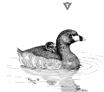
Pied-billed Grebe Podilymbus podiceps