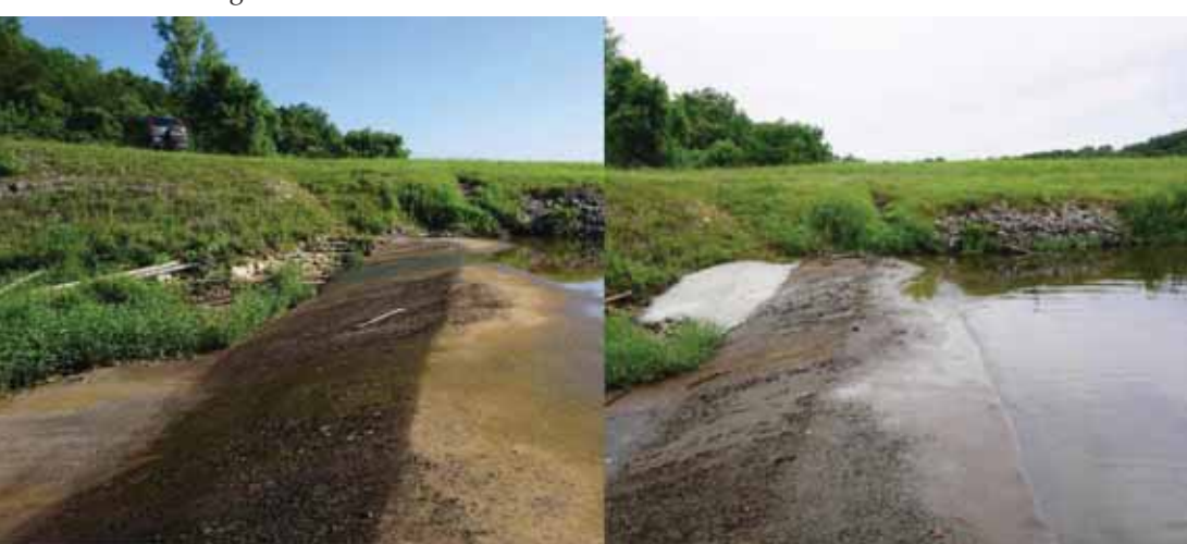
Weir looking towards dam, 6/2/2017

Clarue Holland reported that the Missouri Department of Natural Resources inspected the dam on May 31st prior to the renewal of our license. They thought our dam was beautiful and so much better than most dams they inspect. There are a couple of things we need to take care of. There are a couple of trees in the spillway that need to be removed. There is also a tree on the north side about 5 feet down from the crest that is getting bigger and its roots will be growing towards the lake which will cause channeling. Clarue stated that she has been getting bids. Clarue also stated that the concrete weir is being undercut on the dam side. Matt Holloran repaired the weir by filling the void with concrete for $700.