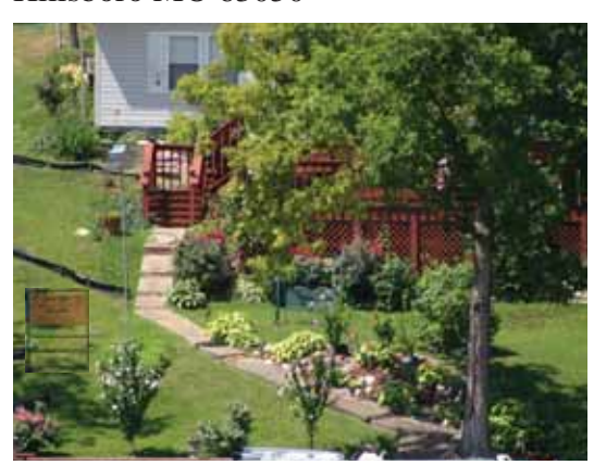
July 2012 Garden of the Month: Niemeyer, A35.

Lake Tishomingo Property Owners Association 5699 Lake Tishomingo Road Hillsboro MO 63050