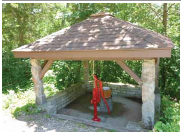
Pump house recently remodeled by the Lakeside Gardeners.

Next Newsletter Deadline: August 20, 2012