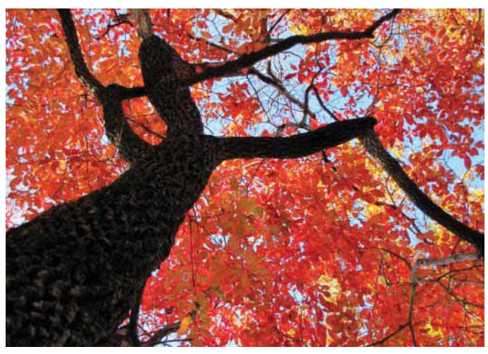
Nyssa sylvatica, the native Missouri Black Gum tree.

As trees die and are removed around the lake few are being replaced. It can take decades for