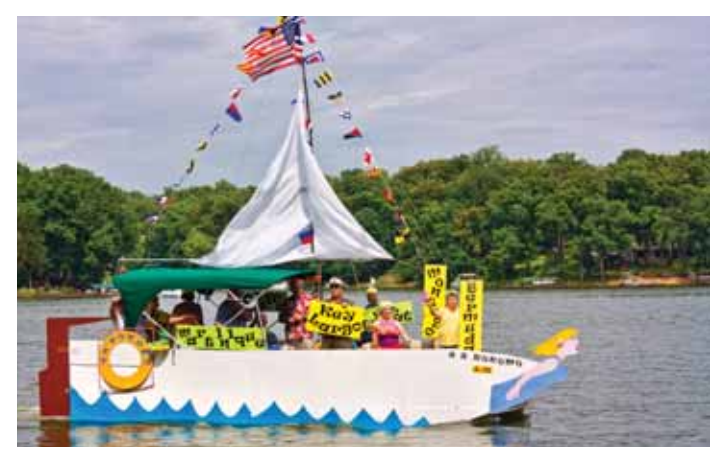
SS Kokomo, Blaha, A36.

More pictures online at laketishomingo.com.