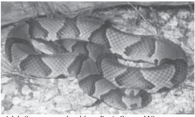
Adult Osage copperhead from Pettis County MO.

markings are often edged in white. The top of the head can be gray, tan or reddish and without any markings. The eyes have vertical pupils. The belly is cream colored with large, dark gray or brown blotches along the edges that extend partly up onto the sides of the body. Young Osage copperheads and some adults have a yellowish tail. Scales along the back are weakly keeled. Adult copperheads range in length from 24 to 36 inches.