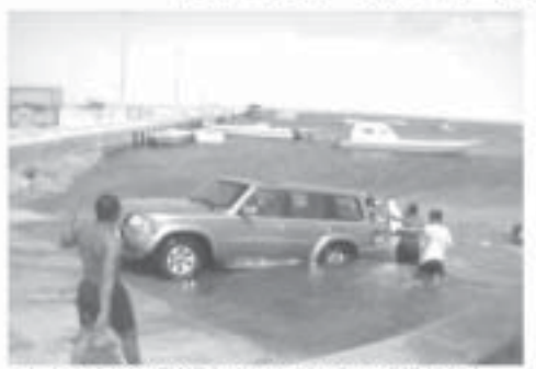
Load your PWC in the back of the SUV, and drive to the nearest launch ramp. Open the back doors of the SUV and back into the water. The Pt should float out into the water.