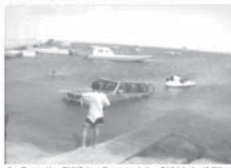
2. Once the PWC is affoat and the SUV is half filled with water, drive the SUV back onto the ramp. helps to have someone stand on the walkway and point toward shore.