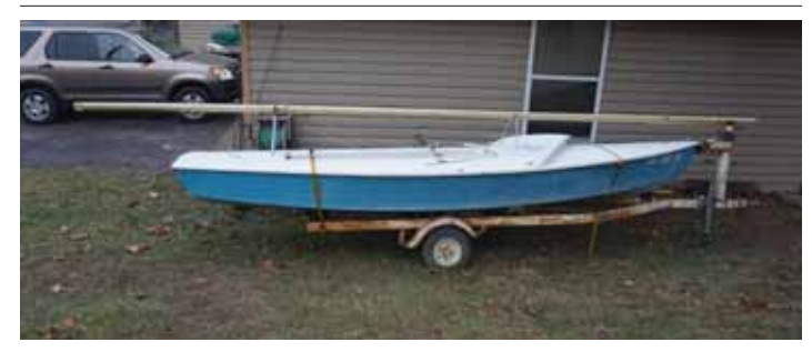
For Sale: Vintage fiberglass Snipe sailboat with trailer, $150 or OBO.

Photos at www.laketishomingo.com/store/classifieds.html, R Hirsch, 636 2850813.