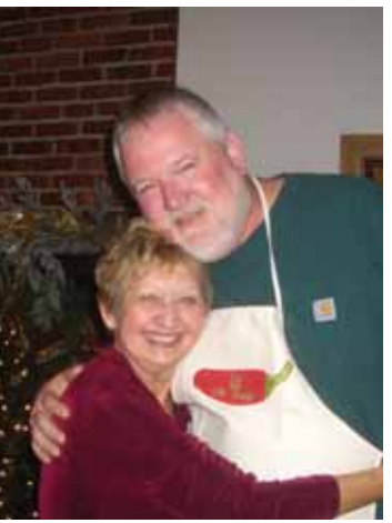
More pictures at http://www.laketishomingo.com/gallery/gallery.html