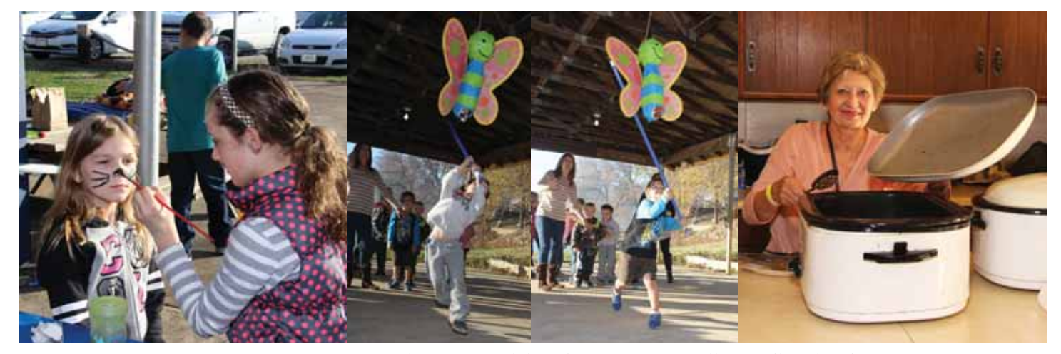
Many more pictures at http://www.laketishomingo.com/gallery/gallery.html