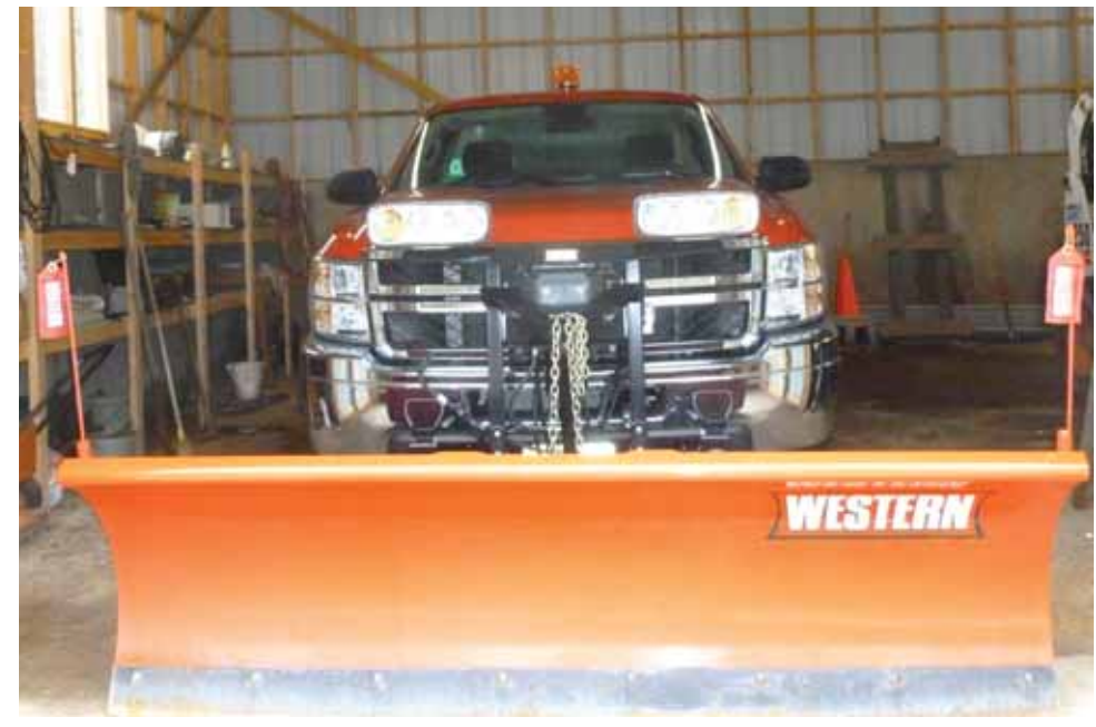
The new truck is a bright red Chevrolet 3500 HD.