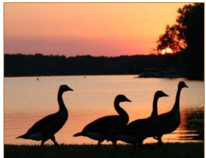
Geese by the Community House

Next Newsletter Deadline is February 20.