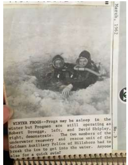
Newspaper clipping from Droege family scrapbook. Original source unknown.

The Droege family still own property here and are active participants in community activities.