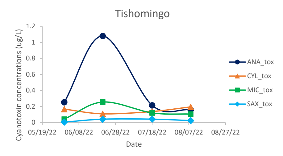
Figure 2. Concentrations of microcystin (MIC_tox), cylindrospermopsin (CYL_tox), anatoxin (ANA_tox), and saxitoxin (SAX_tox) in Tishomingo Lake during summer 2022. Detection limits: microcystin and anatoxin = 0.10 \ \mu g \ L^{-1} , cylindrospermopsin = 0.04 \ \mu g \ L^{-1} , saxitoxin = 0.015 \ \mu g \ L^{-1}

Here, algal toxin results are summarized for the four sampling events at Tishomingo Lake in the summer of 2022 (Figure 2). All four cyanotoxins had detectable concentrations during each lake visit, except for saxitoxin which was below detection on May 31. Both microcystin and cylindrospermopsin (averaging 0.13 and 0.15 \mu g/L, respectively) were well below the EPA's recommended maximum values for recreational water use of 8 and 15 \mu g/L, respectively (Table 1). Anatoxin and saxitoxin were relatively low throughout the summer, except on June 21 when anatoxin concentrations increased to 1.08 \mu g/L.