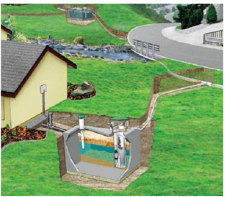
Cutaway view of a typical STEP tank installation.

The WWTP will be built behind the dam as the original developer of Lake Tishomingo intended. It will consist of recirculating sand filters which discharge septic effluent over a bed of sand. The wastewater is filtered by the sand and treated by microbes that form there. Effluent is collected at the bottom of the sand filter and recirculated back to the top of the sand filter for repeat processing several times before final discharge through an ultraviolet disinfection unit. The disinfected water will enter the stream behind the dam and the spillway and end up in Belew Creek.