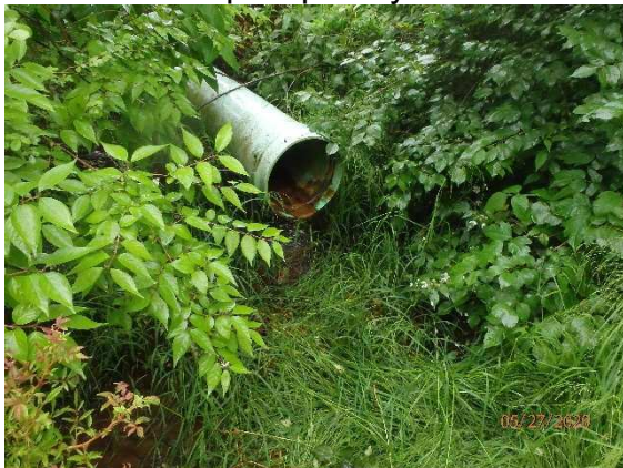
Embankment drain outlet with excess vegetation to remove