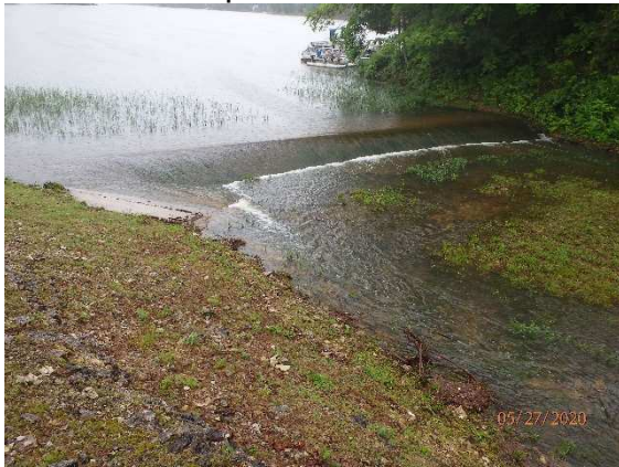
Principal spillway crest