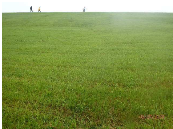
Uneven surface on downstream face to monitor for movement/change