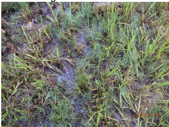
Seepage in right groin near toe (2017 photo)