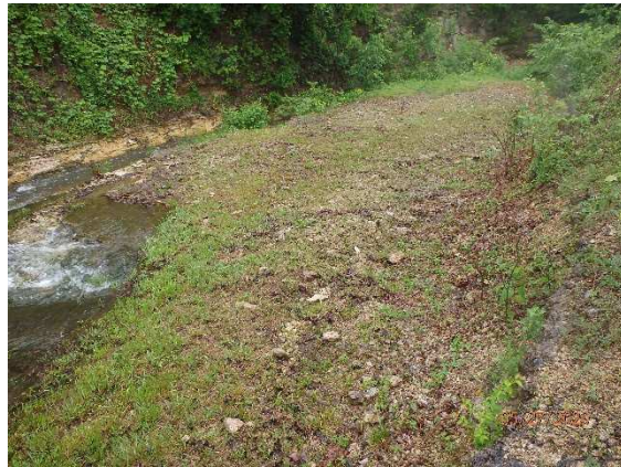
Principal spillway channel