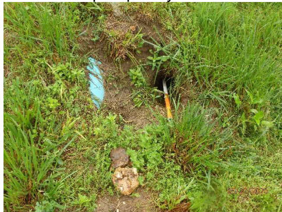
Groundhog burrow to excavate and fill