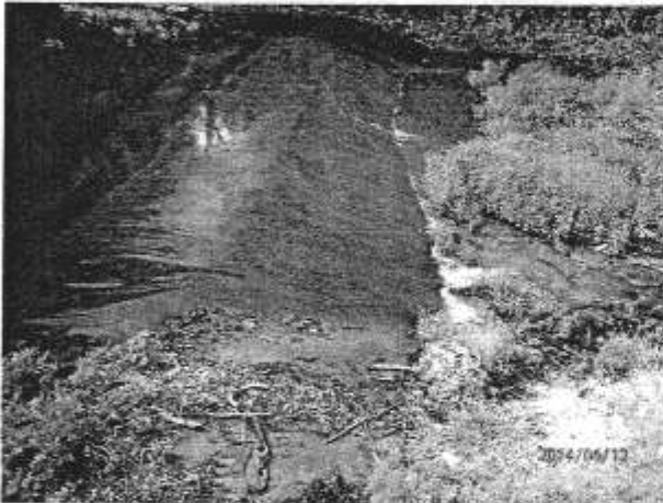
Principal spillway crest