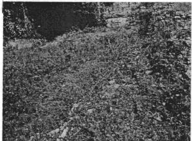
Principal spillway outlet